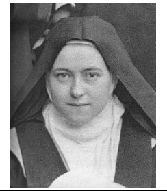
St. Therese of Lisieux