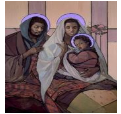
The Holy Family