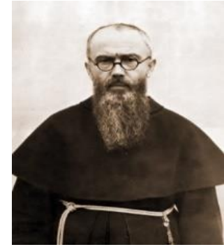
St. Maximilian Kolbe

Respect for the human person proceeds by way of respect for the principle that "everyone should look upon his neighbour (without any exception) as 'another self,' above all bearing in mind his life and the means necessary for living it with dignity." CCC 1931