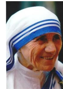
St. Mother Teresa of Calcutta