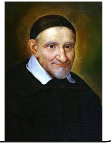
St. Vincent de Paul