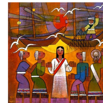
He Qi: Calling Disciples